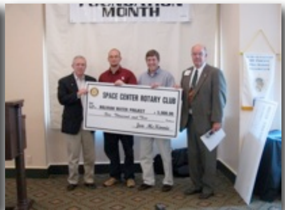
Club Support for Bolivian Water Project