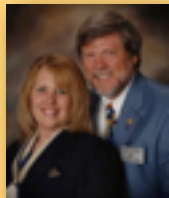
Rotary District 5890 Governor 2009 - 2010