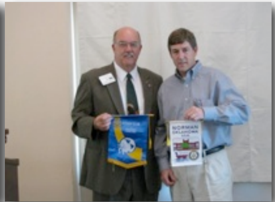
Flag Exchange with Norman OK