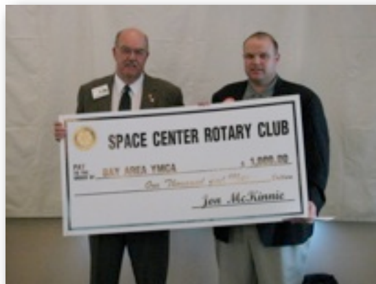
Club Support for YMCA